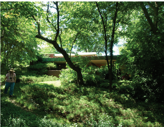
Garden at Samara