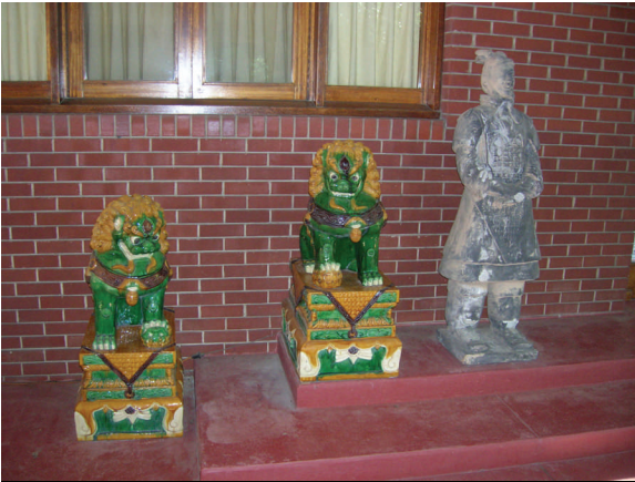
Entry into Samara, a Frank Lloyd Wright home

During 2010, some pre conference touring opportunities included the Hodge Garden at the home of a Gold Level Master Gardener, the Celery Bog/Lily Nature Center and Samara, a Frank Lloyd Wright Home. This included touring the gardens, the interior of the home, and meeting the original owner.